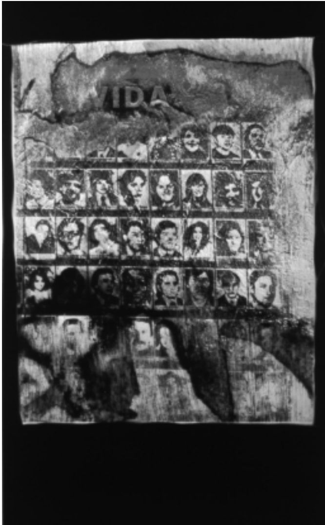
The South/Missing, 1993 Gelatin silverprint, detail from triptych; each panel, 60" x 40"

Developments in the fields of postcolonial and poststructuralist theories in recent years have transformed understandings of the relationships among culture, history, and representation. No longer understood as the transparent documentation of an authentic past, history making can now be seen as a selective process of preservation and omission, in which absences and gaps "speak" as loudly as that which is included. Historians and theorists such as Michel Foucault and Trinh T. Minh-ha have shown that any claim to "truth" or reality is always politically and ideologically motivated, whether consciously or not. Yet truths and histories, however ideologically shaped, have profound, and often devastating, material repercussions. Writing about the relationship between war and representation, Elaine Scarry has noted that there are three "arenas of damage in war, three arenas of alteration: first, embodied persons; second, the material culture or self-extension of persons; third, immaterial culture, aspects of national consciousness, political belief, and self-definition . . . In war, the first and second forms of damage are the means for determining which of the two sides will undergo the third form of damage." 1