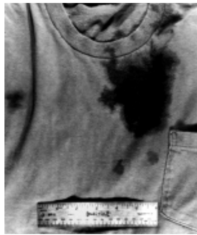
From: Inscriptions , 1993 Gelatin silverprints, detail from installation; 24 panels, each panel 8" x 10"

In "The Hunt," Malagrino juxtaposes different "found" representations -- text, twentieth-century photographs, and an ancient carving -- which, when combined, produce a narrative not only about a history of violence, but also about the urge to represent it and the difficulties and dangers of doing so. Always self-reflective, Malagrino asks how photography and the photographer are implicated in the violence of this "hunt." Through her work, she also asks to what extent she and her medium might play a part in resisting this history.